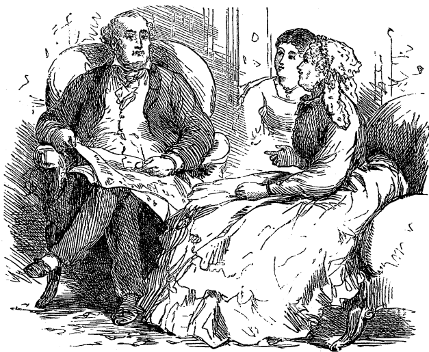
THE VAN ASTRACHANS.

"You know, dear," said Mrs. Van Astrachan to Rose, "that I never like to stay long away from papa" (so the worthy lady called her husband); "and so, if it's just the same to you, you shall let me have the carriage come for me early, and then you and Harry shall be left free to see it out. I know young folks must be young," she said, with a comfortable laugh. "There was a time, dear, when my waist was not bigger